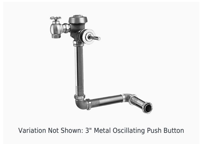
Variation Not Shown: 3" Metal Oscillating Push Button